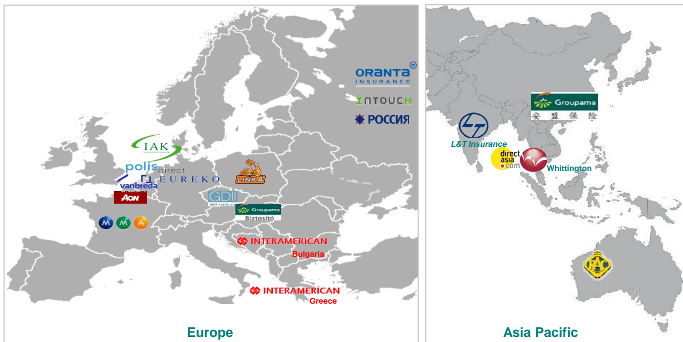
IDIT I.D.I. Technologies — Global Reach

Our customers experience immediate cost savings and can swiftly and profitably introduce new insurance products to meet the changing economic, regulatory and consumer demands.